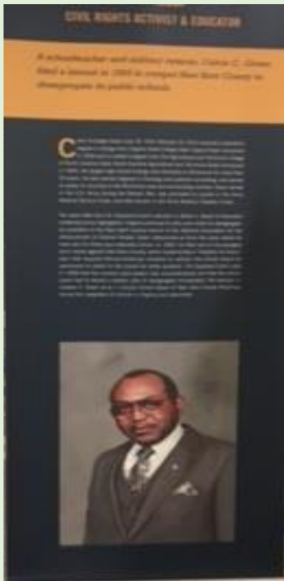
Strong Men & Women In Virginia History